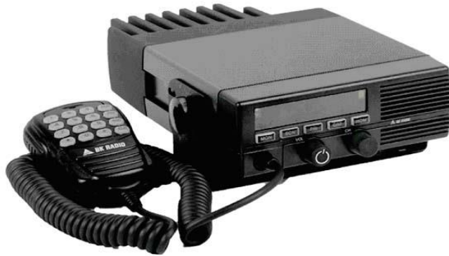
GMH5992XP 50 Watt Dash Mount Mobile Radio