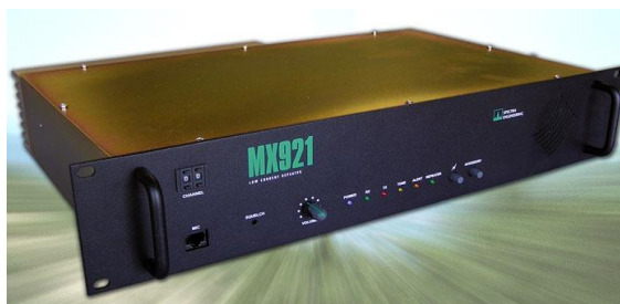
SMX921 Low-Current Repeater