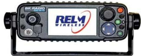
KAA0660 Remote Control Head