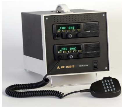
DRH-01/ GRH-01 / GRHP-01 D - Digital G - Analog Microphone sold separate

Prices are for radio only. Microphones and options sold separately.