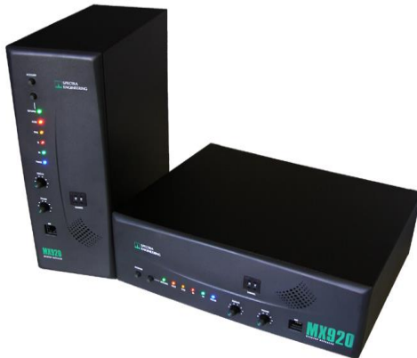
SMX920 Analog Stations (Vertical and Horizontal versions)

*All internal SMX Duplexers must have >5 MHz separation between RX and TX frequencies