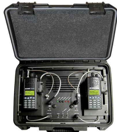
RDPR-HP / HP-1