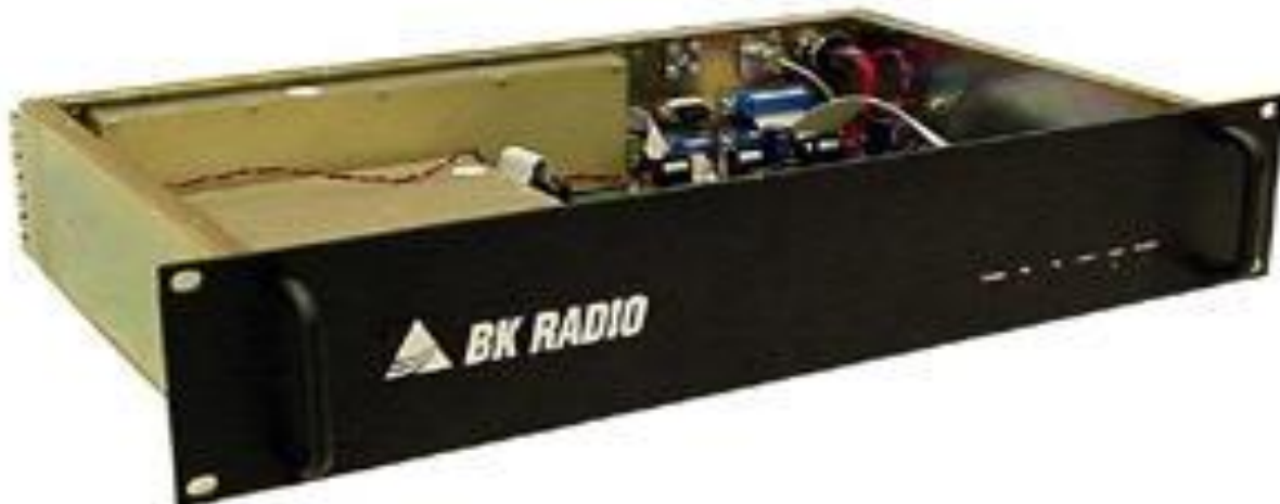
S-Series Analog Repeater

All LZA Options are Factory Installed options only