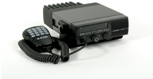
DMH5992X Dash Mount 50 Watt Mobile Radio

Prices for radio only. Installation kits and microphones sold separately.