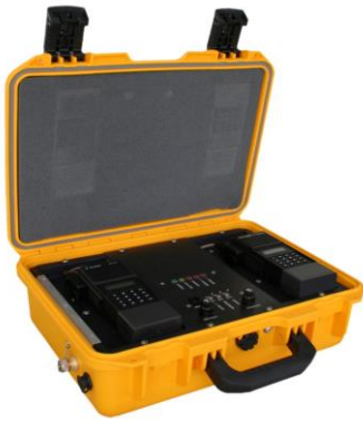
RDPR-00U Yellow Case RDPR-00B Black Case

NOTE: All RPDR's require an "RIKXXX" Interface Kit