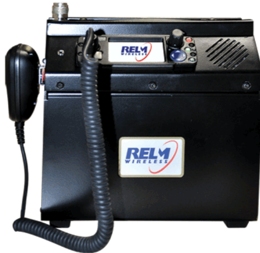
KNG-TMR XXX Microphone not included

Units come with Internal Battery 4004-40012-603, Wall Charger WCRDPRUM and Shoulder Strap Microphones sold separately.