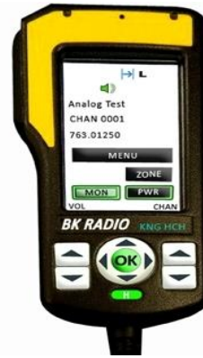
KAA0670 HCH Handheld Control Head